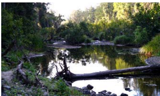
And now something completely different with a moonlight image. Well taken Margaret.